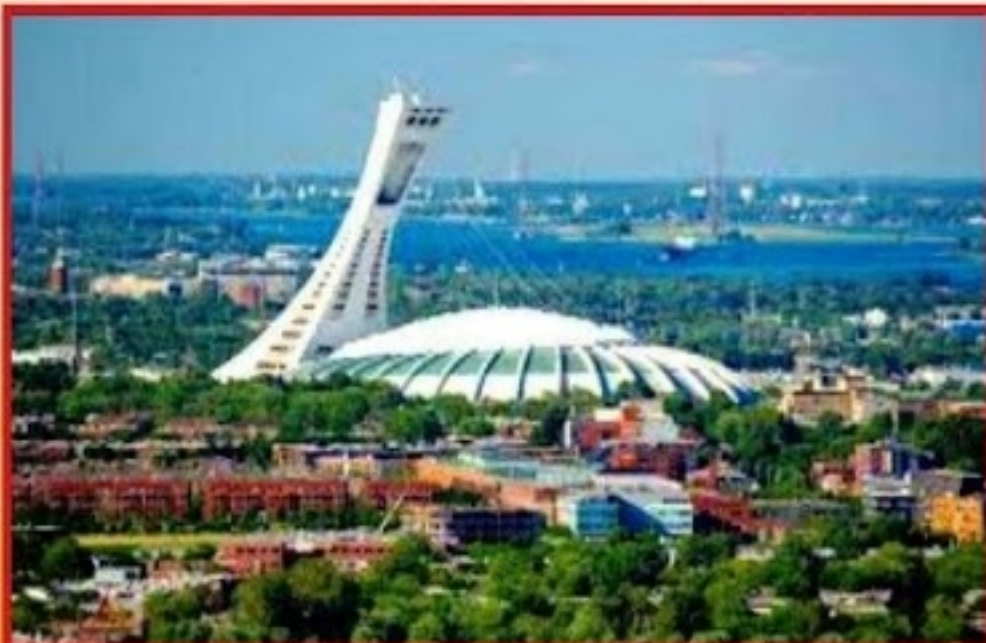
ऑलिंपीक टॉवर मोन्ट्रीअल