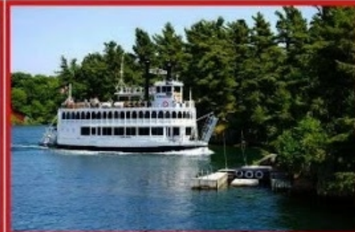
१००० बेट क्रुज