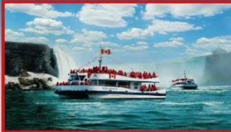
हॉर्न ब्लोअर क्रुज